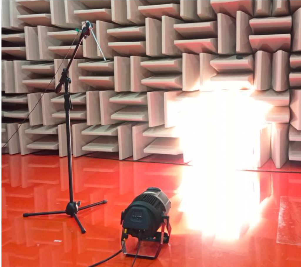
Figure 1: Test setup

The product was placed indoors in a semi-anechoic room in the internal Lab of Harman Technology in Shenzhen, China (See Figure 1). The ceiling and walls were all acoustically absorbent, and the floor was reflective. The main dimensions of the room were 5.9m * 4.9m * 3.3m (length * width * height).