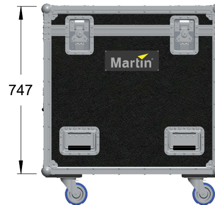
747 780 FRONTVIEW