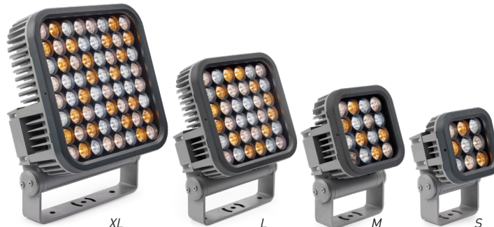
THE COMPLETE MARTIN EXTERIOR WASH PRO CTC LINE

HARMAN PROFESSIONAL INC. • 8500 BALBOA BOULEVARD • NORTHRIDGE • CA 91329 • USA • +1 818 893 8411