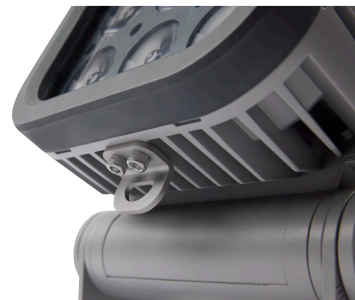
ATTACHMENT PLATE FOR SAFETY WIRE INSTALLED