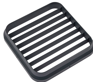
BAFFLE SNOOT PRO XL CTC