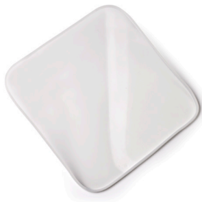
EXTERIOR WASH PRO MICRO LENS