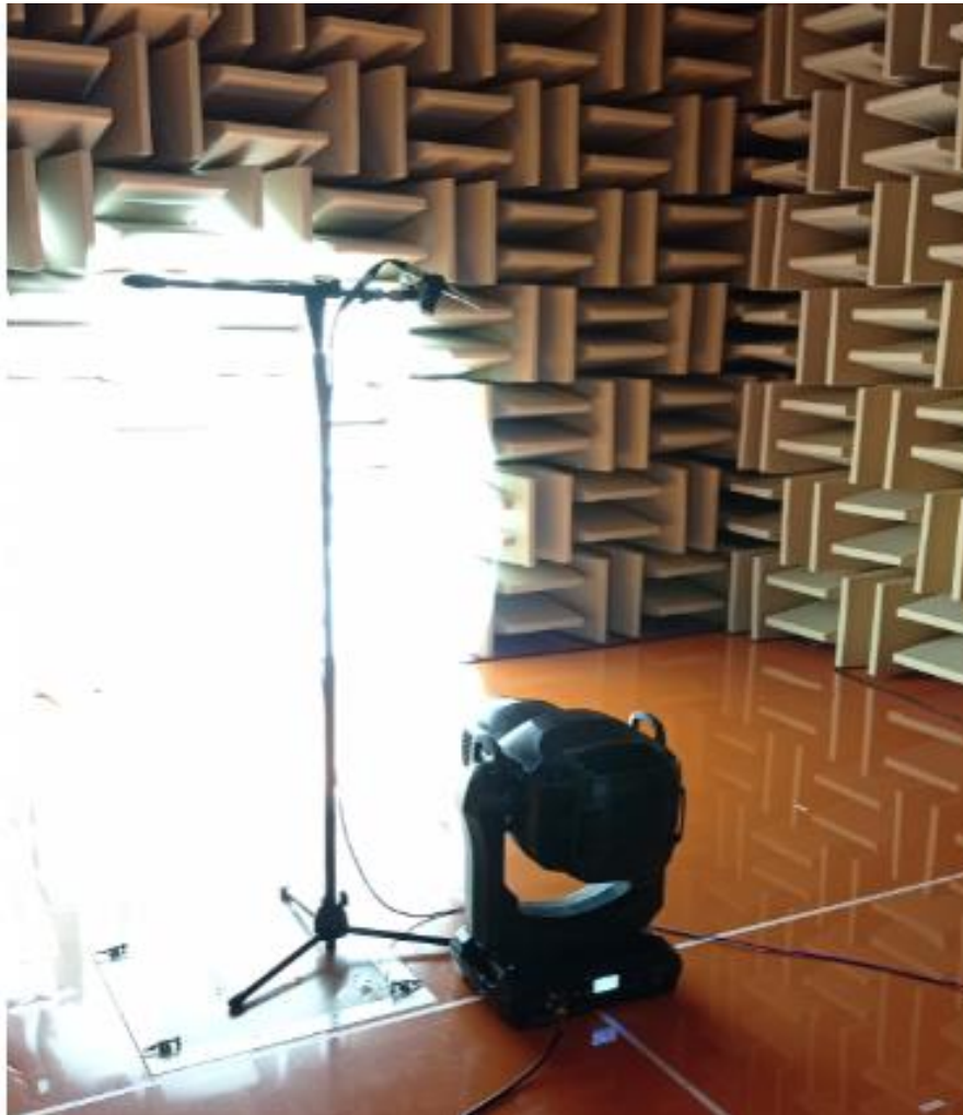
Figure 1: Test setup

The product was placed indoors in a semi-anechoic room in the internal Lab of Harman Technology in Shenzhen, China (See Figure 1). The ceiling and walls were all acoustically absorbent and the floor was reflective. The main dimensions of the room were 5.9m * 4.9m * 3.3m (length * width * height).