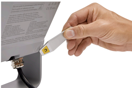
EXTERIOR WASH PRO MULTI-TOOL