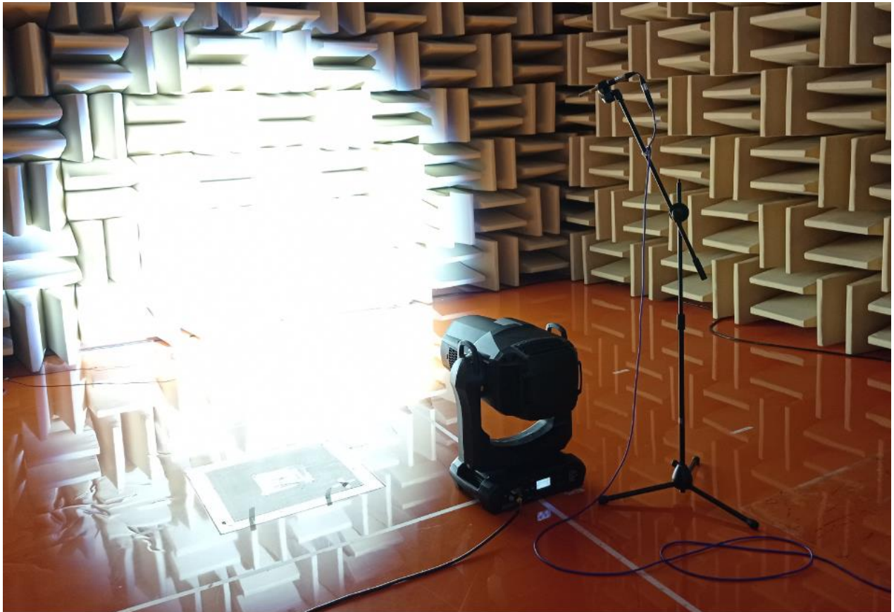
Figure 1: Test setup

The product was placed indoors in a semi-anechoic room in the internal Lab of Harman Technology in Shenzhen, China (See Figure 1). The ceiling and walls were all acoustically absorbent and the floor was reflective. The main dimensions of the room were 5.9m * 4.9m * 3.3m (length * width * height).