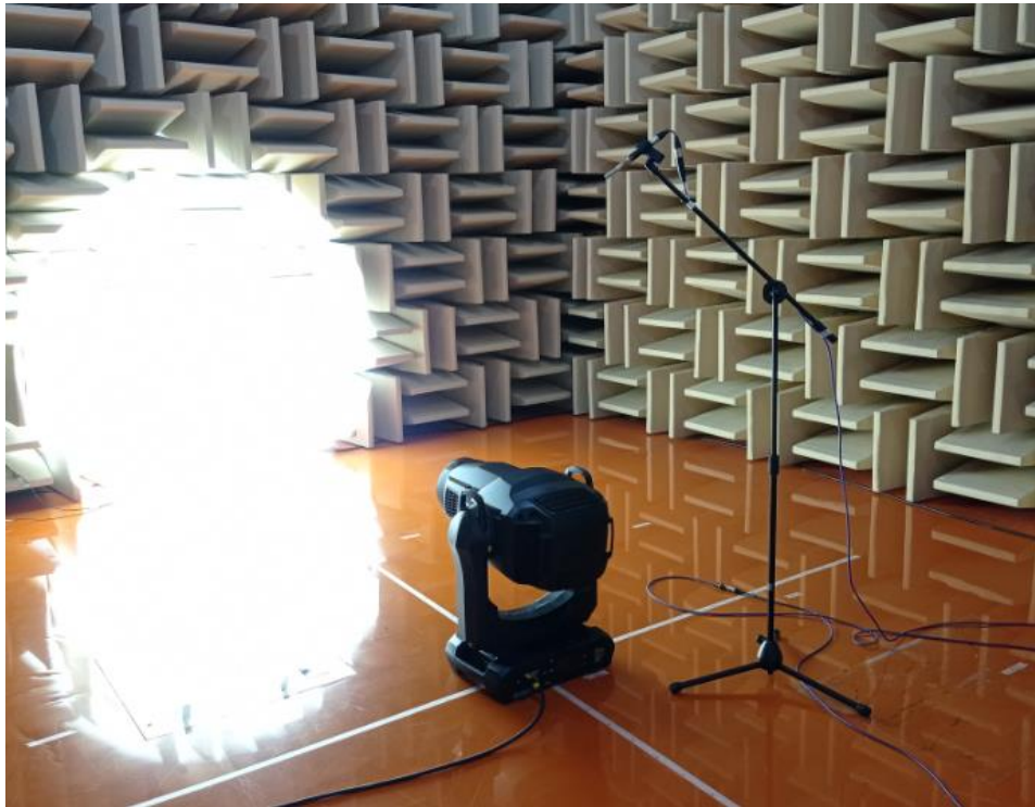
Figure 1: Test setup

The product was placed indoors in a semi-anechoic room in the internal Lab of Harman Technology in Shenzhen, China (See Figure 1). The ceiling and walls were all acoustically absorbent and the floor was reflective. The main dimensions of the room were 5.9m * 4.9m * 3.3m (length * width * height).