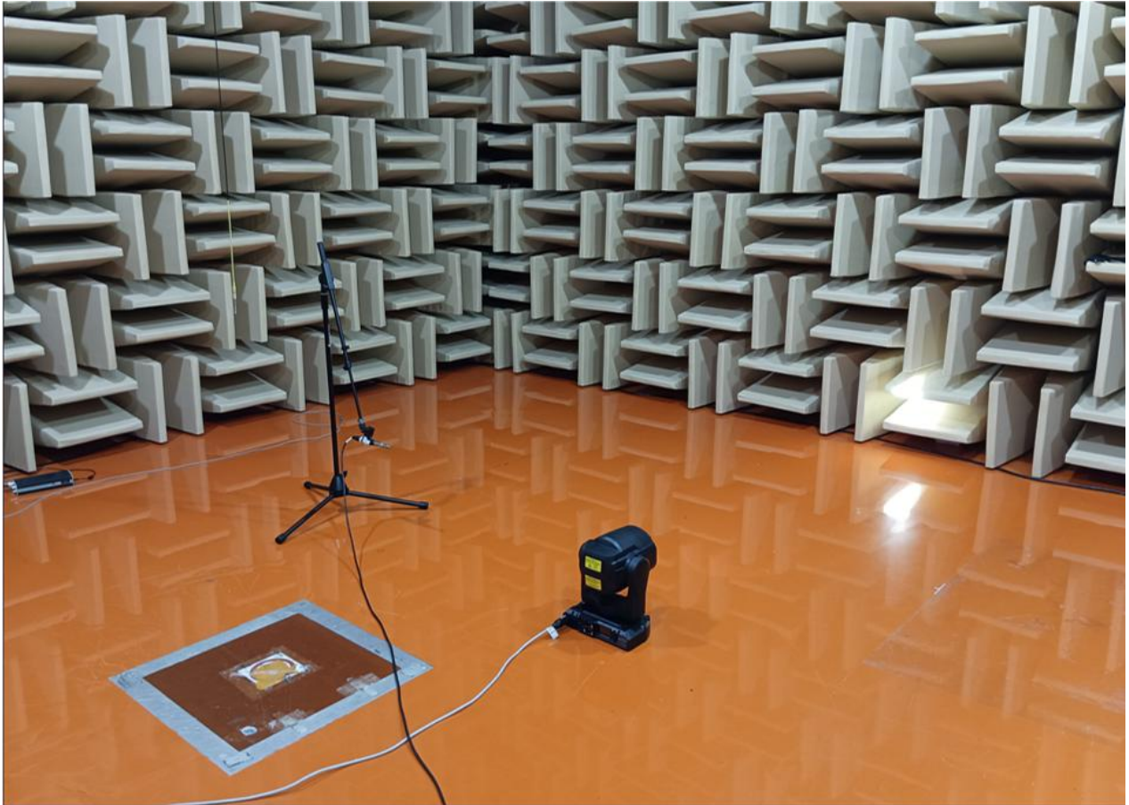
Figure 1: Test setup

The product was placed indoors in a semi-anechoic room in the internal Lab of Harman Technology in Shenzhen, China (See Figure 1). The main dimensions of the room were 5.9m * 4.9m * 3.3m (length * width * height).