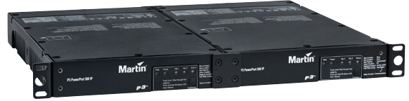
Dual Unit 19-inch Rackmount